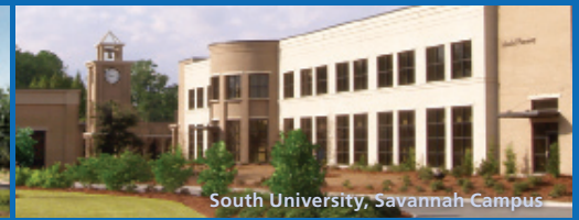
South University, Savannah Campus