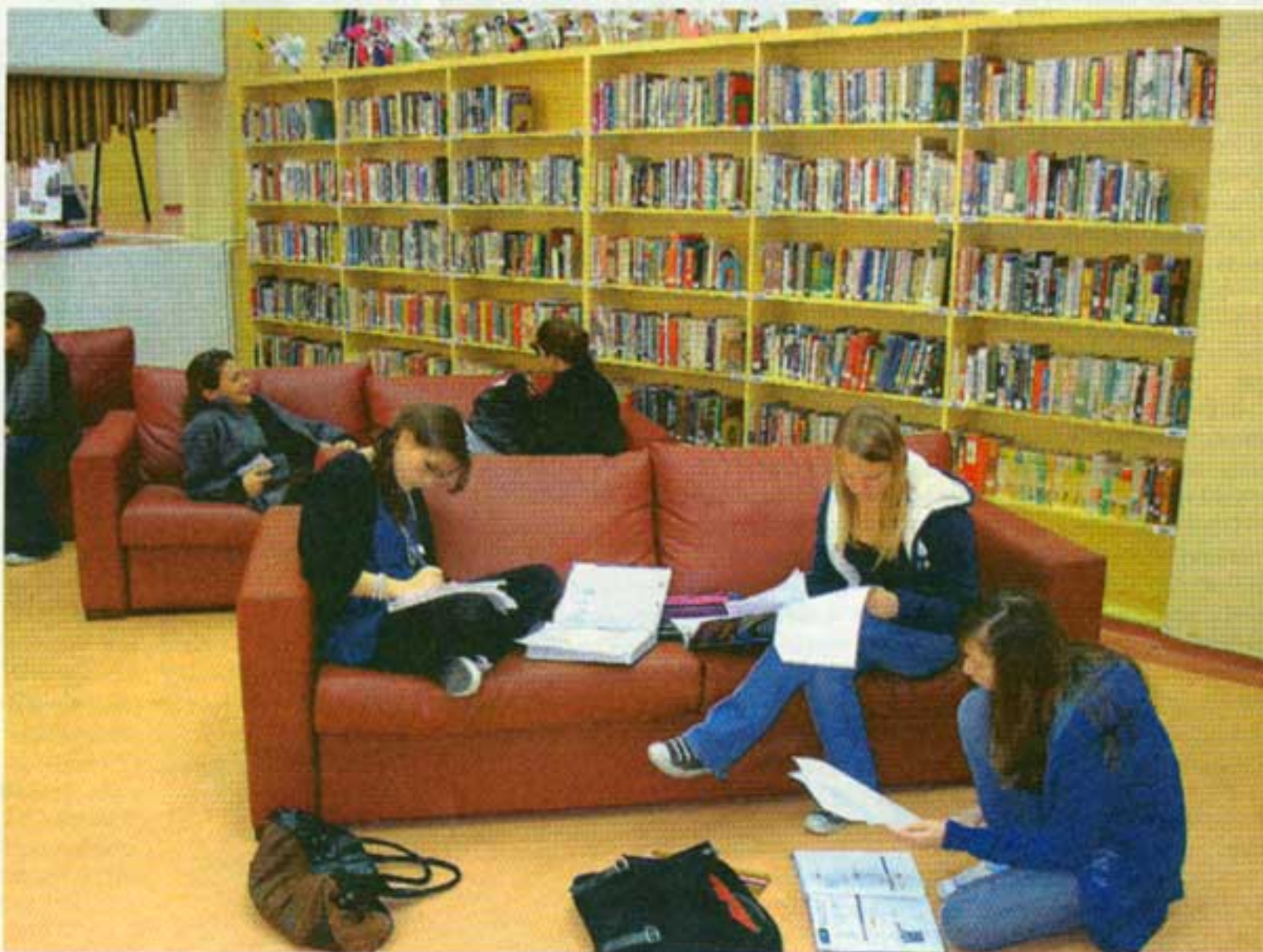
View of students of ACS Athens in the Academy Library study hall.

The Summer Institute begins with three days of experiential team-building activities and a series of workshops in ethical decision-making in Athens, leading to the development of a personal leadership profile. The second week of the program will take participants to the campus of the University of Richmond for a week-long college learning and living experience, focusing on study of the foundations of leadership. Following their academic experience, participants will have the opportunity to experience leadership up-close and in action, as they travel to Washington, DC, to meet and learn from leaders